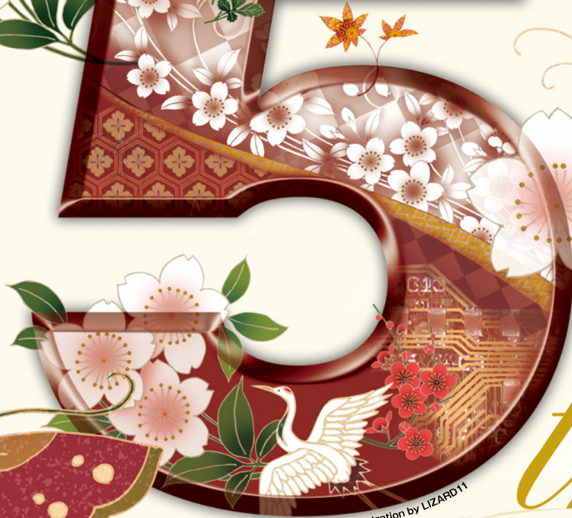
Illustration by LIZARD11